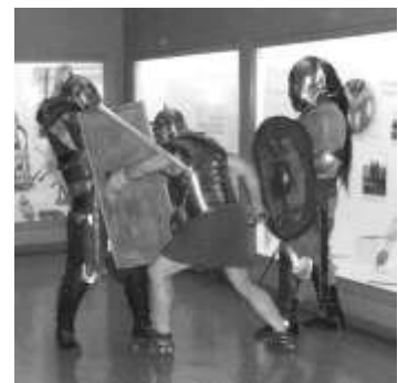
Celts and Romans slug it out

Ferocious battles fought by Roman and Celtic warriors (re-enactors) were also among the highlights of the Fair. The fair was such a hit that we are organizing a second annual fair for March 11-12, 2011. Stay tuned!