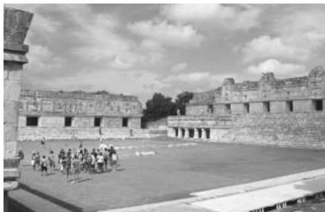
Tourists at the Nunnery Quadrangle palace complex at Uxmal, Yucatán.