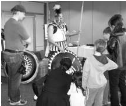
Greek Hoplite explains his weapons to visitors

The Fair featured more than two dozen presentations assembled by 69 individuals representing 26 groups. Presenters included a mix of professional archaeologists, students, museum educators and docents, re-enactors, and even some elementary, middle and high-school students. Presenters came from several universities around Wisconsin including the University of Wisconsin at Milwaukee, Green Bay and LaCrosse; Marquette University; and Carthage College. Local museums participated also, including the Milwaukee Public Museum, Discovery World, the Oconto Archaic Copper Museum, and the Kenosha Public Museum. Local archaeology groups such as the AIA-Milwaukee Society, the Kenosha County Archaeology Society, and the