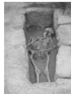
Roman Burial from Gordion